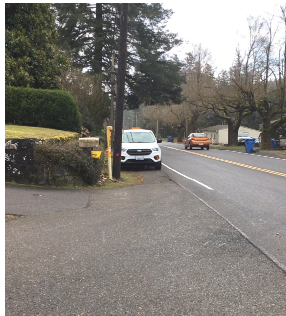
Figure 2: Sight distance from NE 39 th Avenue looking south.